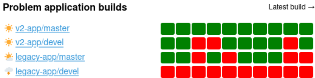
Fig. 1: An example showing jobs matching a certain name pattern “*-app”