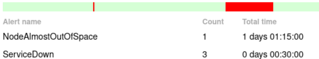
Fig. 1: An example rendered alert summary. The timeline at the top displays the points in time when any alert was firing over the report window. Individual alert labels are not shown; the view’s purpose is to highlight trends or patterns that can be looked at in more detail at the source.